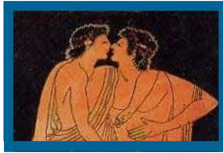
Greek Males - from Pottery (no copyright)

Every ceremony is unique. Our celebrants love celebrating relationships. They consider it an honour to be part of your special day. Please feel free to contact the International College of Celebrancy, or the celebrant whose name and address appears on the back of this brochure.