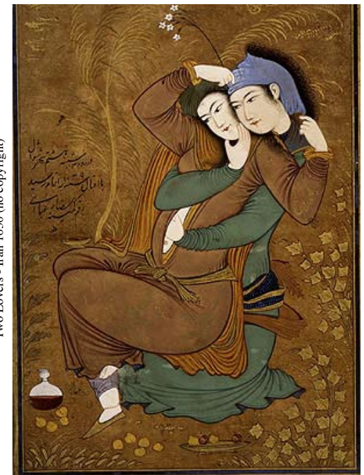
Two Lovers - Iran 1630 (no copyright)

Gay relationships will increase their place enriching our community as gay people claim their cultural right to mark their commitment with a ceremony of equal dignity and substance to heterosexual couples.